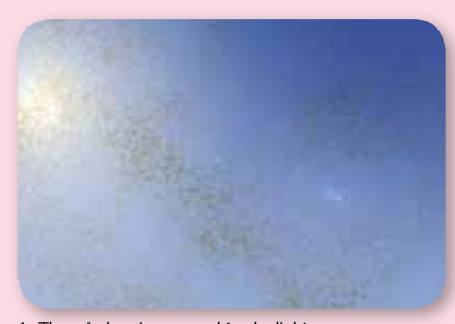
1. The window is exposed to daylight.

The coating is integral to the glass – it will not flake off or discolour, so it can only be affected if the surface itself is damaged; for example, by pointed objects, abrasive cleaners or steel wool.