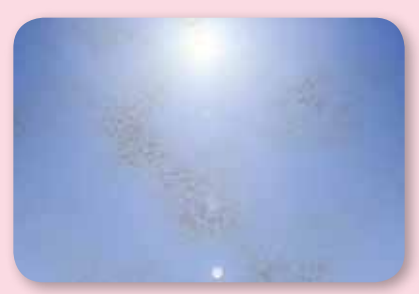
2. Daylight triggers the Pilkington Activ™ coating.